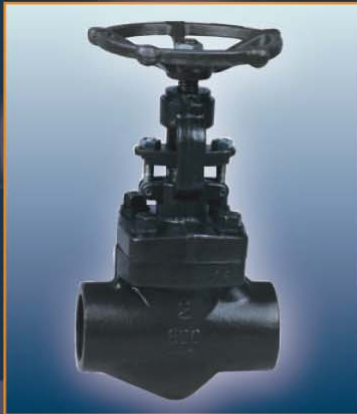
Forged Globe Valve