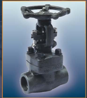
Forged Gate Valve