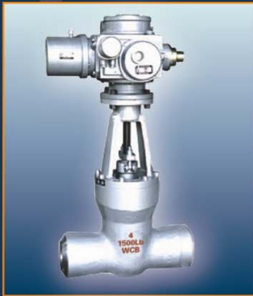
Pressure Seal Gate Valve