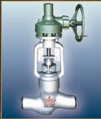
Pressure Seal Globe Valve